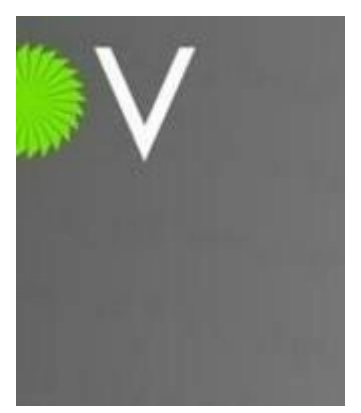
Tbilisi, MELANI 3